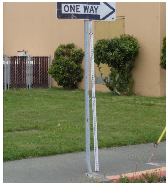
Above picture depicts a sign post which is damaged and needs replacement