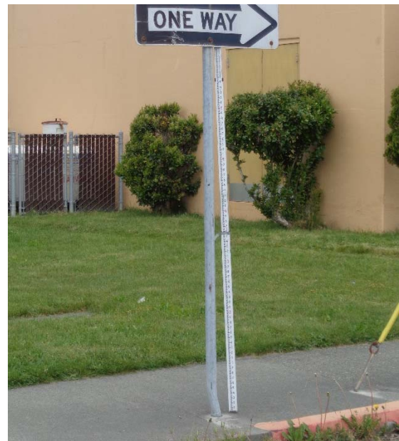
Above picture depicts a sign post which is damaged and needs replacement