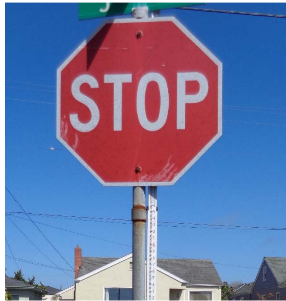
Above picture depicts a sign which failed Retroreflectivity test