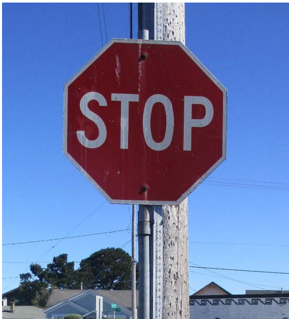
Above picture depicts a sign which passed Retroreflectivity test but is damaged