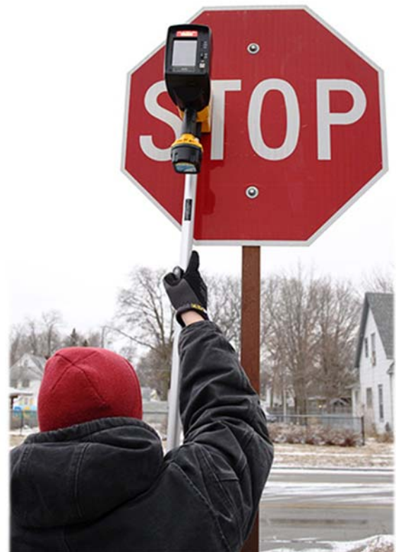
Table 2A.3, identifies the minimum retroreflectivity levels for CAMUTCD-standard signs, focusing in particular on regulatory, warning, and guide signs. Signs which are below minimum levels need to be