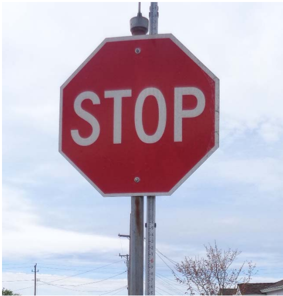
Above picture depicts a sign which passed Retroreflectivity test