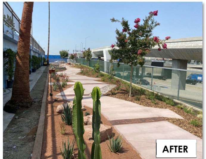
110/28 th Street, Los Angeles